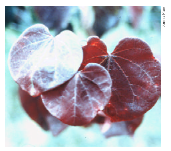
Cercis canadensis 'Forest Pansy', a purple-leaved redbud.