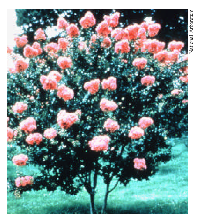
Lagerstroemia x fauriei 'Seminole', a Crapemyrtle introduced by the National Arboretum.