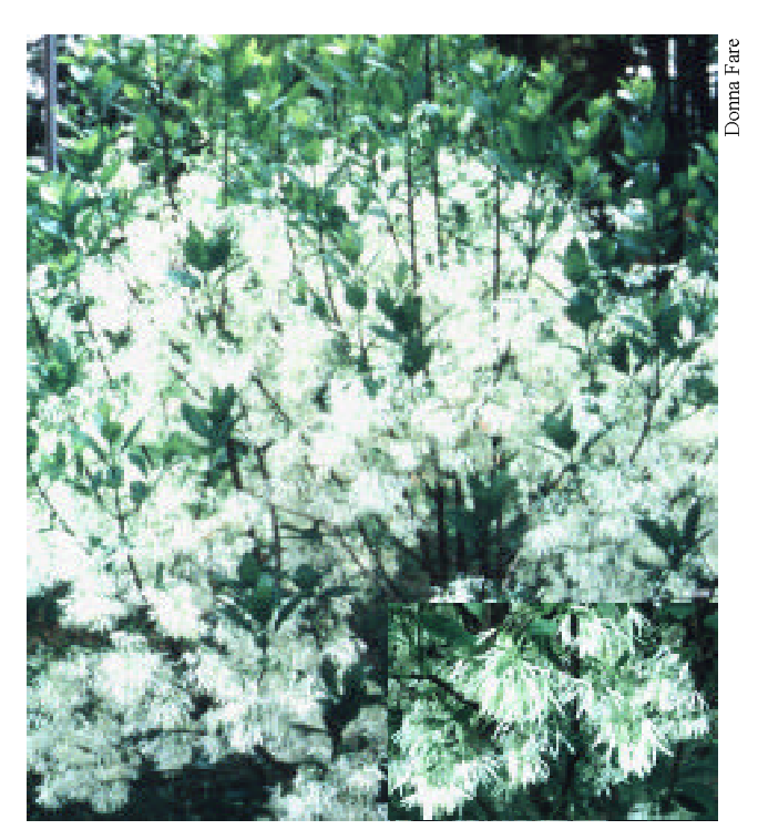
Spring flowering of the native White Fringetree, Chionanthus virginicus .

Carefully select your small flowering trees to ensure they fit into the landscape. In addition to their blooms, they can screen objectionable views, provide more privacy by adding height to a fence or give interest as specimen plants. Most small residential landscapes need only a few flowering trees. They should not be scattered indiscriminately over an area, but grouped according to height and canopy forms. Avoid combining trees with extremes in canopy forms and texture. Trees are more distinctive when there is a thread of continuity between them.