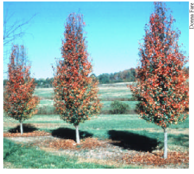
Fall color on Pyrus calleryana 'Cleveland Select'. Spring flowering is similar to Bradford pear.

If major corrective pruning is needed to shape the canopy or to remove large branches, then late winter or early spring is the optimal time. Pruning in March-April will promote rapid wound closure. You may forgo the flower display for that season, but you will promote vegetative growth for the desired canopy form.