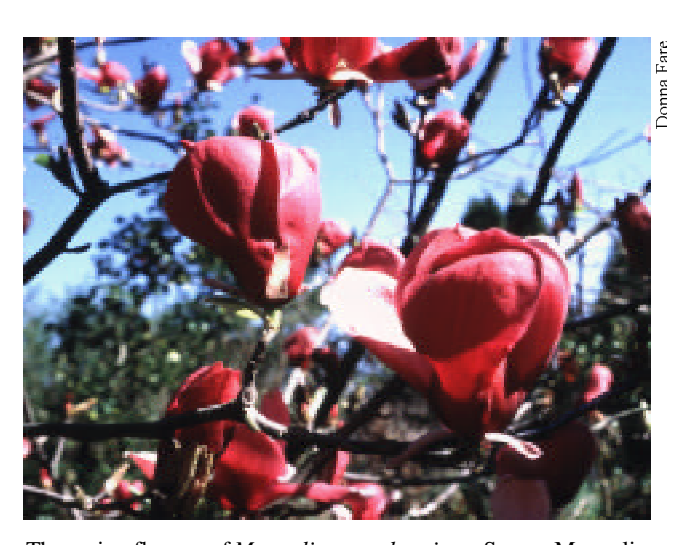
The spring flowers of Magnolia x. soulangiana , Saucer Magnolia, are very showy, but sometimes injured by late frosts.