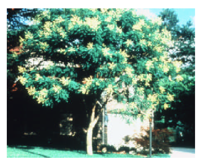
Koelreuteria paniculata, Golden Raintree, is one of the few yellow flowering trees used in landscapes.

Pruning . Pruning at the wrong time of the year and excessive pruning are both common causes of failure to bloom. Excessive pruning stimulates new vegetative growth and may limit flower bud set. A rule of thumb is to prune springflowering plants immediately after flowering, because new flower buds are set on the subsequent summer growth. Summer-flowering plants can be pruned immediately after flowering or during late winter or early spring. Flower buds are set on the current season's growth.